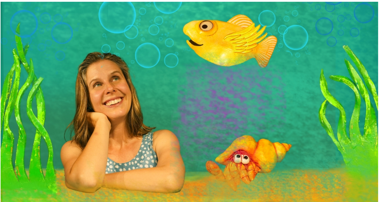
2. Little Wing Puppets are bringing the show "The Fish That Wanted To Fly" as well as shadow puppet-making workshops for younger audiences to Twyford Hall on 13 & 14 January (Supplied: Little Wing Puppets).